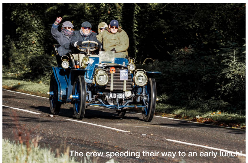
The crew speeding their way to an early lunch!